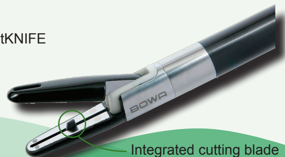
Integrated cutting blade